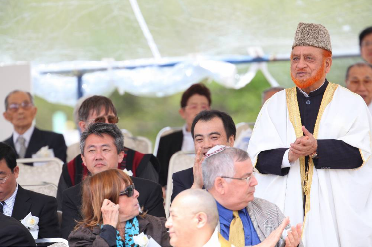
Entry of the flags of the world to the prayer field