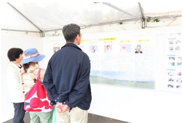
Some stopped by the booths.