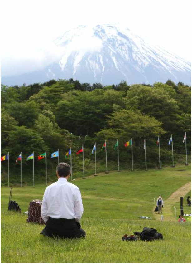
Participants spent their time leisurely.